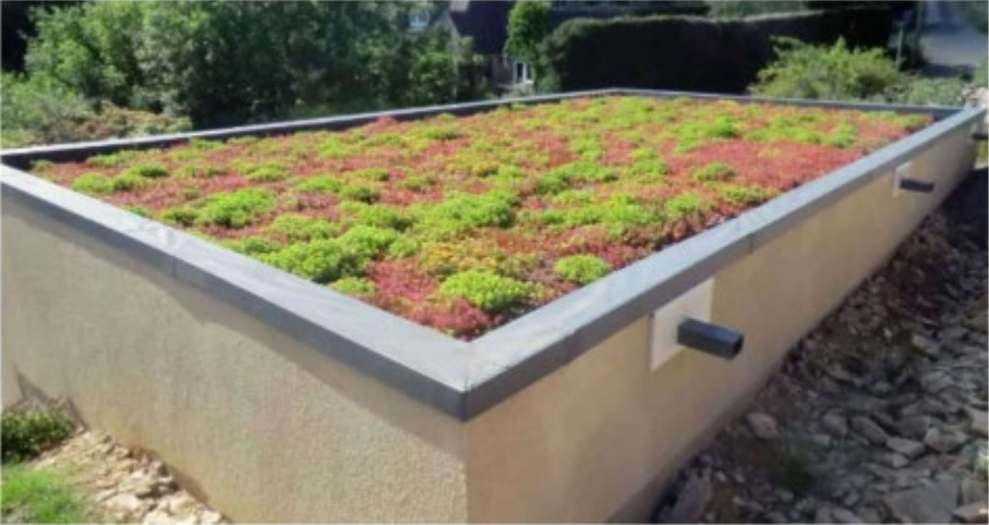
WTCW Roof Top Schematic of Gravel Ballast with a Partial Green Roof Technology